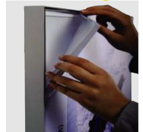
easy to replace